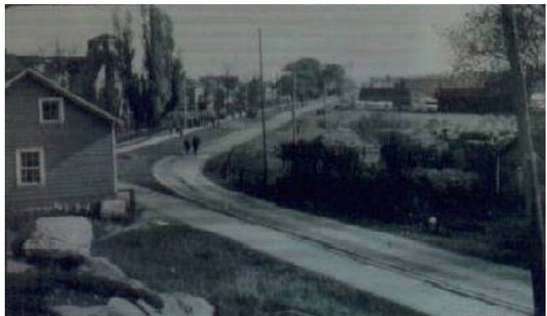
The village of Killarney's atmospheric character has changed little since this photo was taken.

But the village was much as it is now. Though some of the small businesses were different, the bigger ones have been remarkably durable. Life has doubtless changed for the villagers in the years since the highway and park came into being, but for visitors, things are much the same as they were 35 years ago.