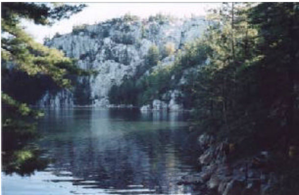
The cliffs of Great Mountain Lake