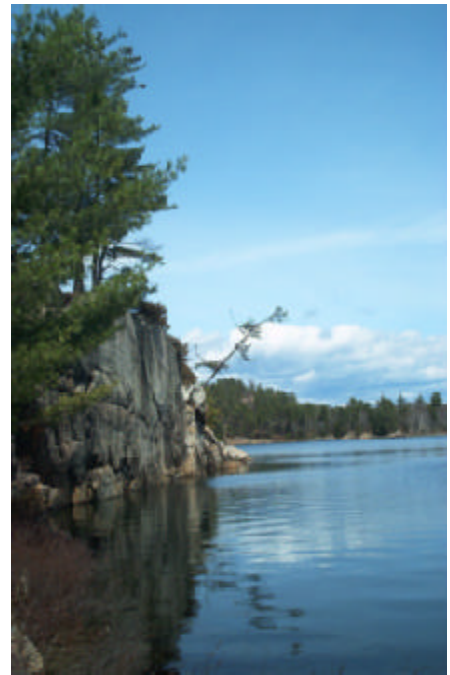
George Lake's idyllic waters await the summertime visitor.

Live music and plenty of fresh Georgian Bay fish.