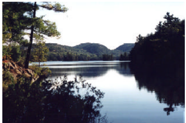
Early morning on Grace Lake